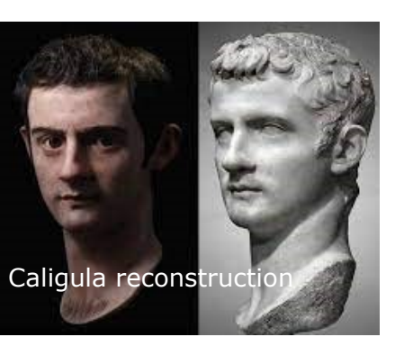
image of himself as a god set up in the Temple in Jerusalem. In 39 he ordered the new governor of Syria, Petronius, to use two of

Caligula became Roman emperor in 37 and soon showed signs of megalomania. He wanted an