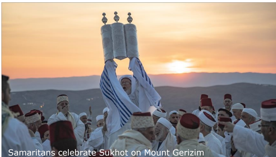
Samaritans celebrate Sukhot on Mount Gerizim

This is not about the group in Britain and elsewhere who help those with suicidal thoughts. It is about the group who appear in the New Testament. The Samaritans are unusual in several ways, not least because there are still almost one thousand of them, mainly living around their sacred mountain, Mt Gerizim, where they believe that God gave Moses the Torah including the Ten Commandments. Over the last thirty years, there has been a 'boom' in Samaritan studies. This is not just about new translations and discoveries of ancient texts, but also new archaeological work.